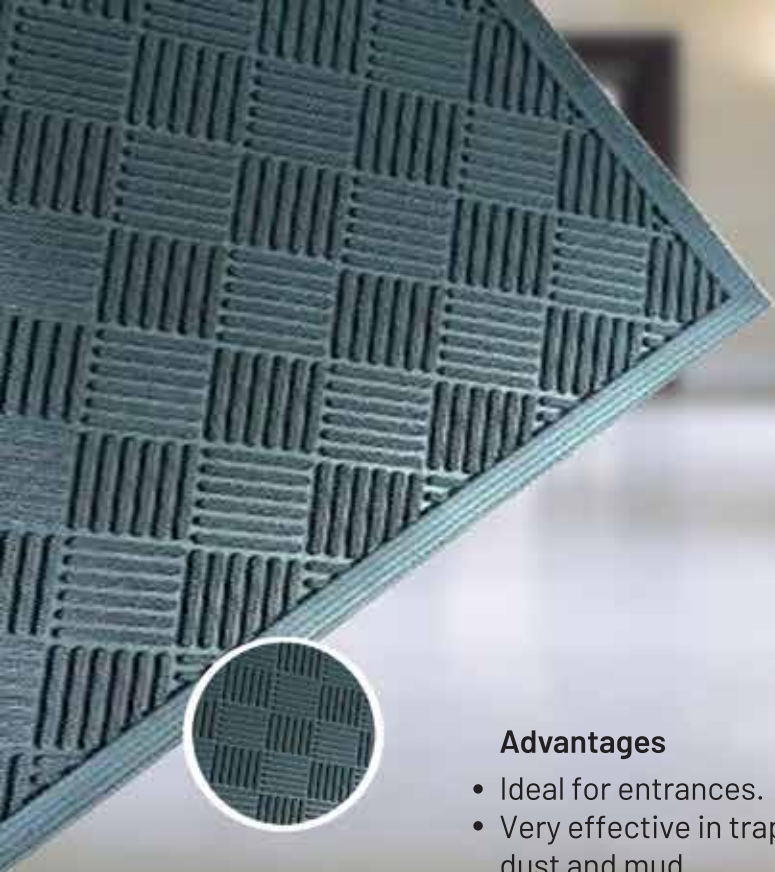
Clean Scraper Mats